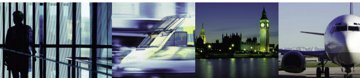
Corporate security entrance and exit monitoring